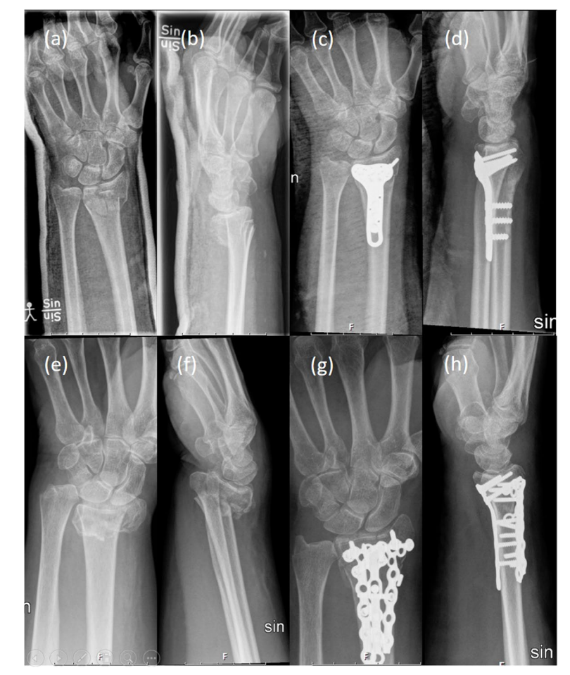
Fig. 1 Distal radius fracture reduced and fixated with volar plating (a-d) and combined plating (e-h)

The day after surgery the patients were given instructions regarding edema control, finger and shoulder movement and pain reduction by a hand therapist before discharge from the hospital. The wrist was immobilized in a volar cast for 2 weeks. Two weeks postoperatively, the patients were followed up by a hand surgeon, and a wrist X-ray was performed. The patients started physiotherapy under the guidance of a hand therapist and were given a prefabricated removable wrist orthosis. The orthosis was to be used for 2 weeks and only removed during range of motion exercises. Continued use of the orthosis was decided by the patient. The patients were instructed to use the injured hand in light daily activities. The patients received instructions to exercise the wrist for 10 minutes 4-5 times a day at home and to